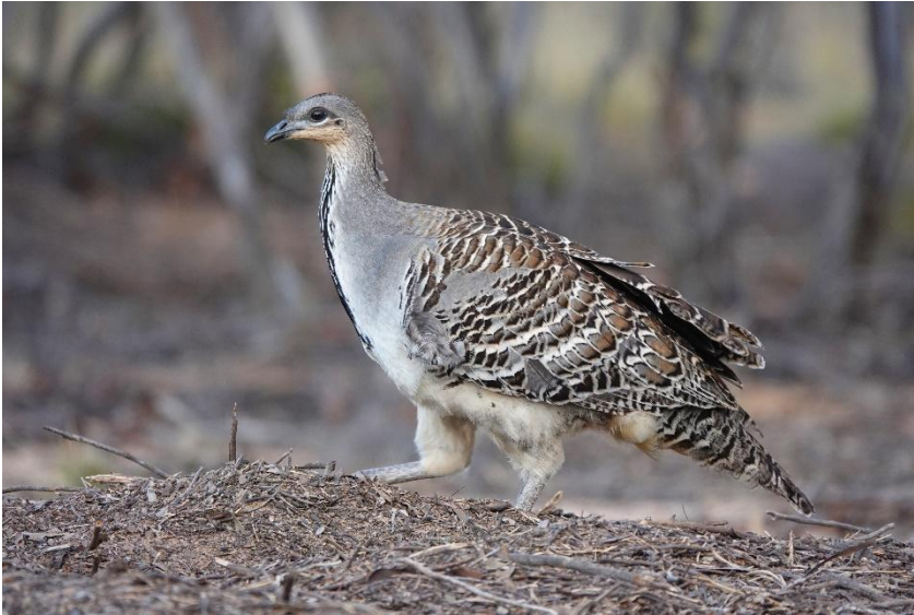
Malleefowl near Ouyen

Without doubt, the star attraction of the Deniliquin area is the strange, diminutive, buttonquail-like Plains-wanderer. The sole representative of an endemic Australian family, it was until recently very poorly known. We will go out at night with Phil Maher, the acknowledged expert on this species, and thus have a very good chance of finding this normally very difficult to find, in fact critically endangered, native grassland inhabitant. Other birds we may encounter on this nocturnal foray include Banded Lapwing, Little Buttonquail, Stubble Quail, Eastern Barn Owl, Tawny Frogmouth, Australian Owlet-Nightjar,