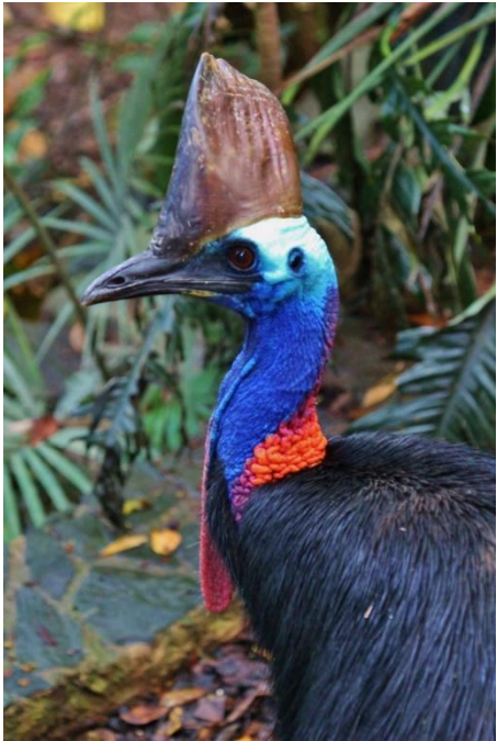
Southern Cassowary near Kuranda

October 14, Day 11: The Great Barrier Reef. Today we will visit the largest and one of the most spectacular and biologically diverse coral reefs in the world. Australia's Great Barrier Reef harbors tens of thousands of tiny coral cays and islets and a wonderful array of marine life. We will take an all-day boat trip to visit the outer reef and Michaelmas Cay, where tens of thousands of terns should be nesting in addition to other patrolling tropical seabirds such as Greater Frigatebird; Brown, Red-footed and perhaps Masked boobies; Great Crested, Lesser Crested, Common, Roseate, Bridled, Sooty and stunning Black-naped terns; and Common and possibly Black noddies. There will also be plenty of opportunity for those who wish to snorkel and explore the reef itself. We will see a stunning array of colorful reef fish, coral gardens and a good chance for marine turtles. Please read the section specifically on this day later in the itinerary.