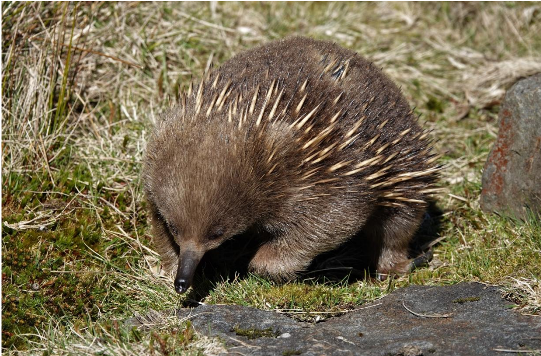
The unusual egg-laying Echidna maintains healthy populations in Tasmania but may still be difficult to bump into.

pathways, and Tasmanian Pademelons are tame. With luck we may encounter nocturnal birds like the Tawny Frogmouth or Tasmanian Boobook. The photographic opportunities are excellent.