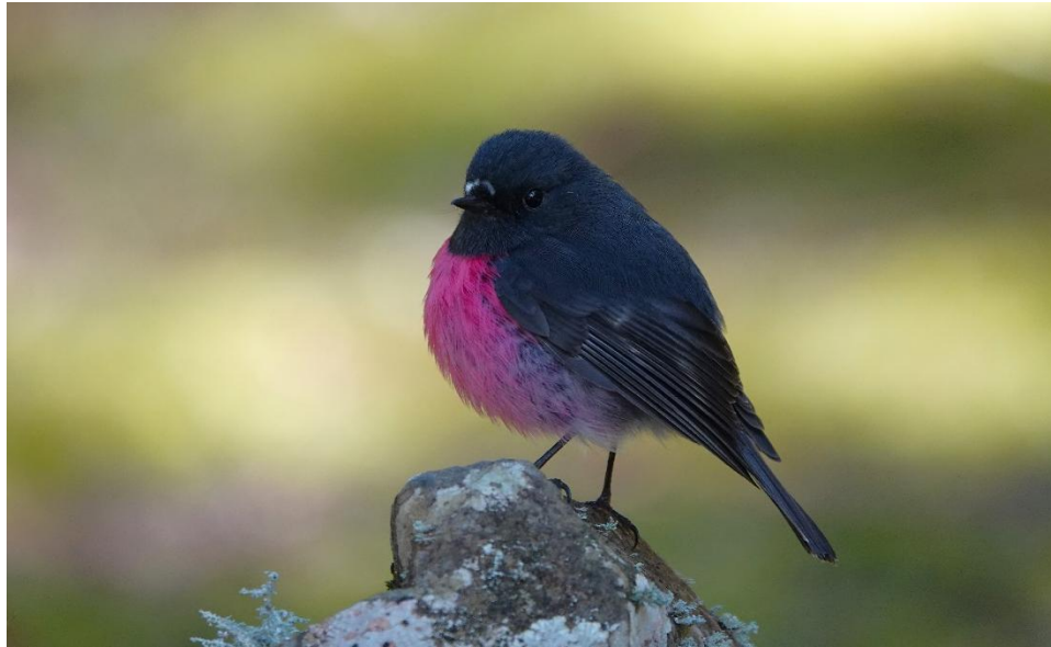
Pink Robin at Cradle Mountain