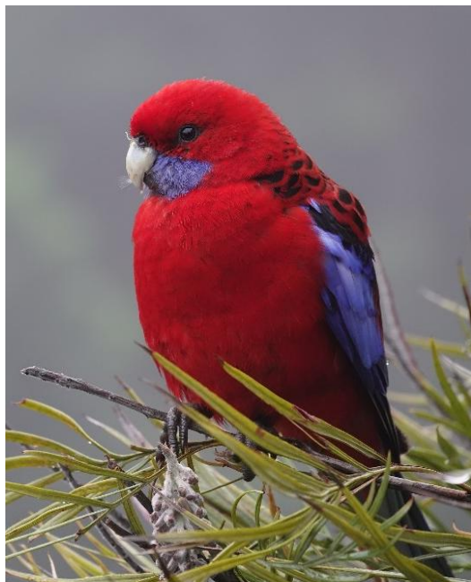
Crimson Rosella

NIGHT: O'Reilly's Guest House, Lamington National Park