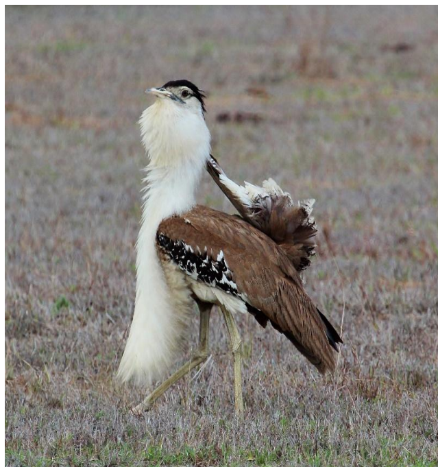
Australian Bustard on display